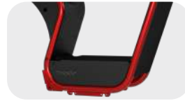
London Red Gloss