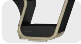
Desert Camo Matte