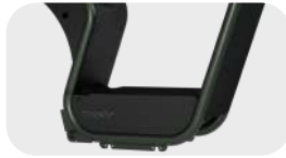
Bush Camo Matte