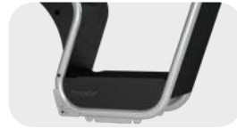
Alabaster Grey Gloss