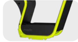
Citrus Yellow Metallic