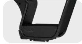
Obsidian Grey Metallic